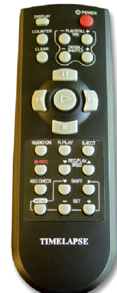
Scan frame by frame in forward and reverse using the digital shuttle

The SL830 Pro includes RS232 control software (PC) for remote control of the VCR. Includes command strings for integration into commercial control equipment