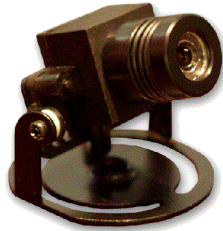
SLC-128C Color Camera