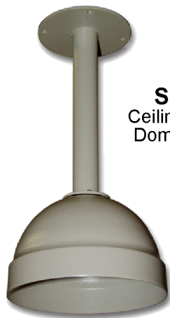
SLB220 Ceiling Mounted Dome Housing

These high quality mounting brackets protect the SLC-148C Color Motorized Dome Camera for use indoors or outdoors. Both the ceiling and wall mount styles include heavy duty stainless steel mounting hardware.