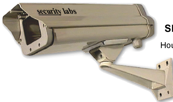
SLH320 & SLH320HB Weatherproof Camera Housings w/ Pan & Tilt Mount

For use with SLC-110, SLC-115, SLC-120 or any camera with a 1/4" x 20 standard mounting hole. The SLH320HB is a heated version of the SLH320 (described above) and is otherwise identical. The heater and blower fan inside the housing keep the front camera window clear of frost and humidity. The heater and fan work automatically and are thermostat controlled. The SLH320HB includes a power supply with 50' of cable.